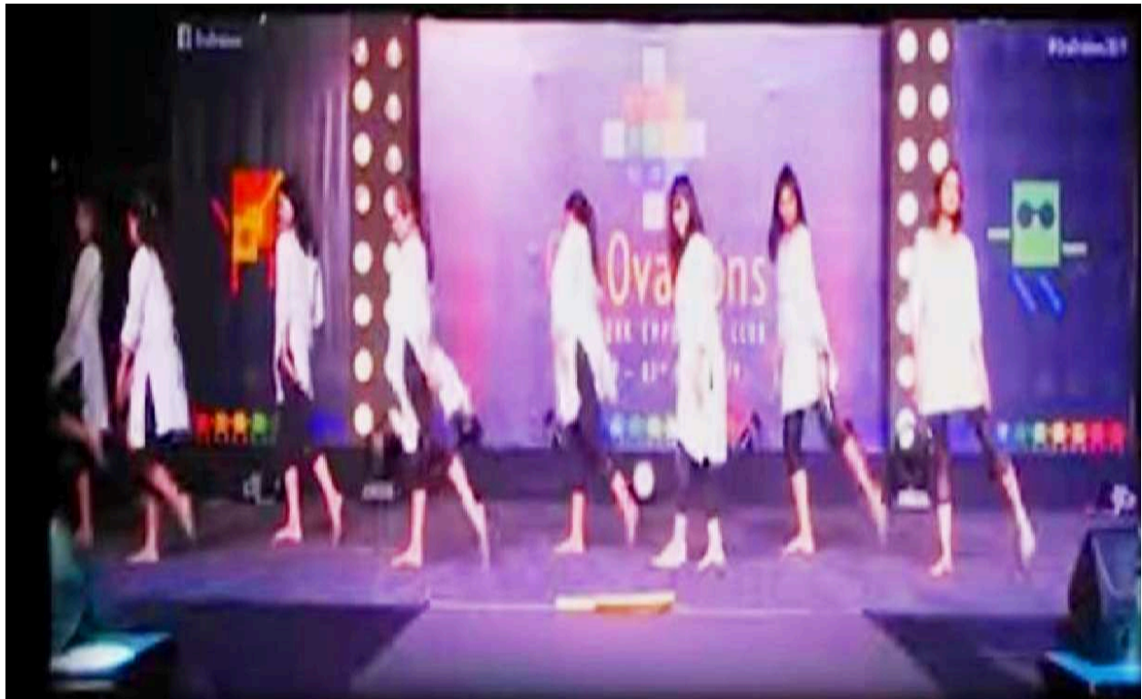
Picture of female student participant performing during the Cultural event

celebrate and appreciate various cultural expressions, promoting inclusivity and understanding. Through vibrant performances, exhibitions, and interactive activities, attendees had the opportunity to engage with diverse cultures, reinforcing the importance of mutual respect and appreciation for our shared humanity.