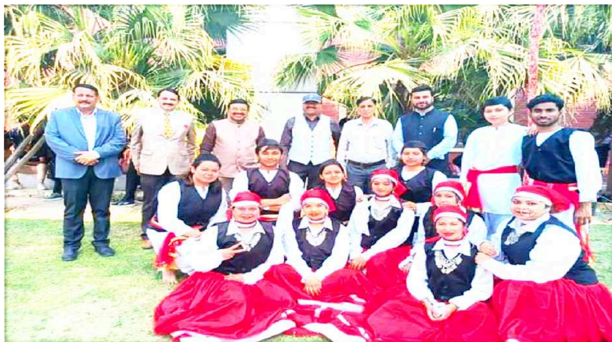
Guests and Senior Faculty Members Posing with Garhwali dance competitors