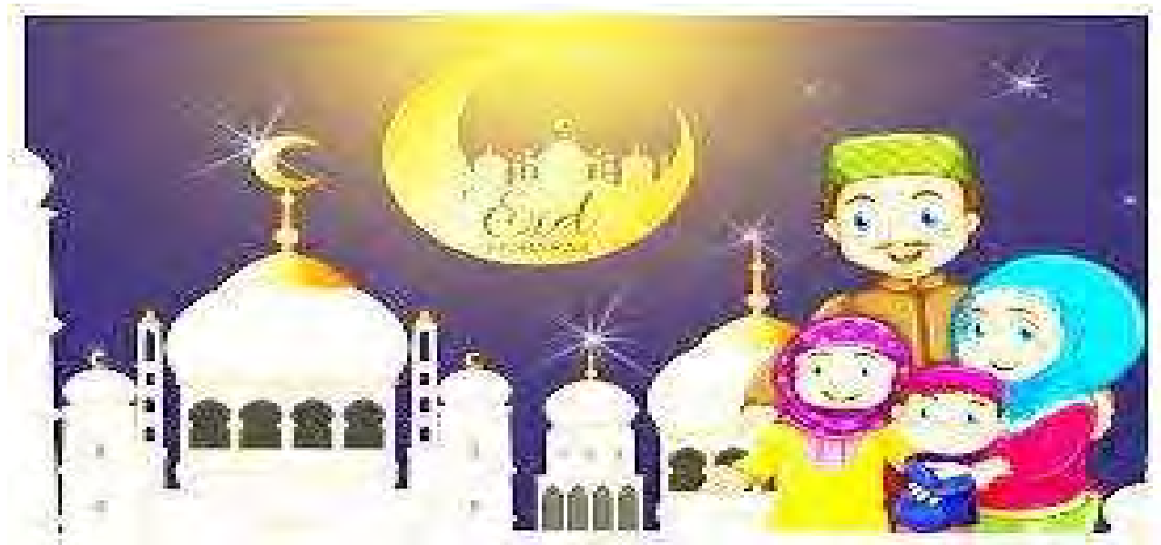
Image: EID Greetings

The festivities served as a beautiful example of communal harmony, where students from various backgrounds came together in shared joy and gratitude. Quantum University's dedication to fostering a sense of belonging and appreciation for cultural diversity was evident throughout the celebration.