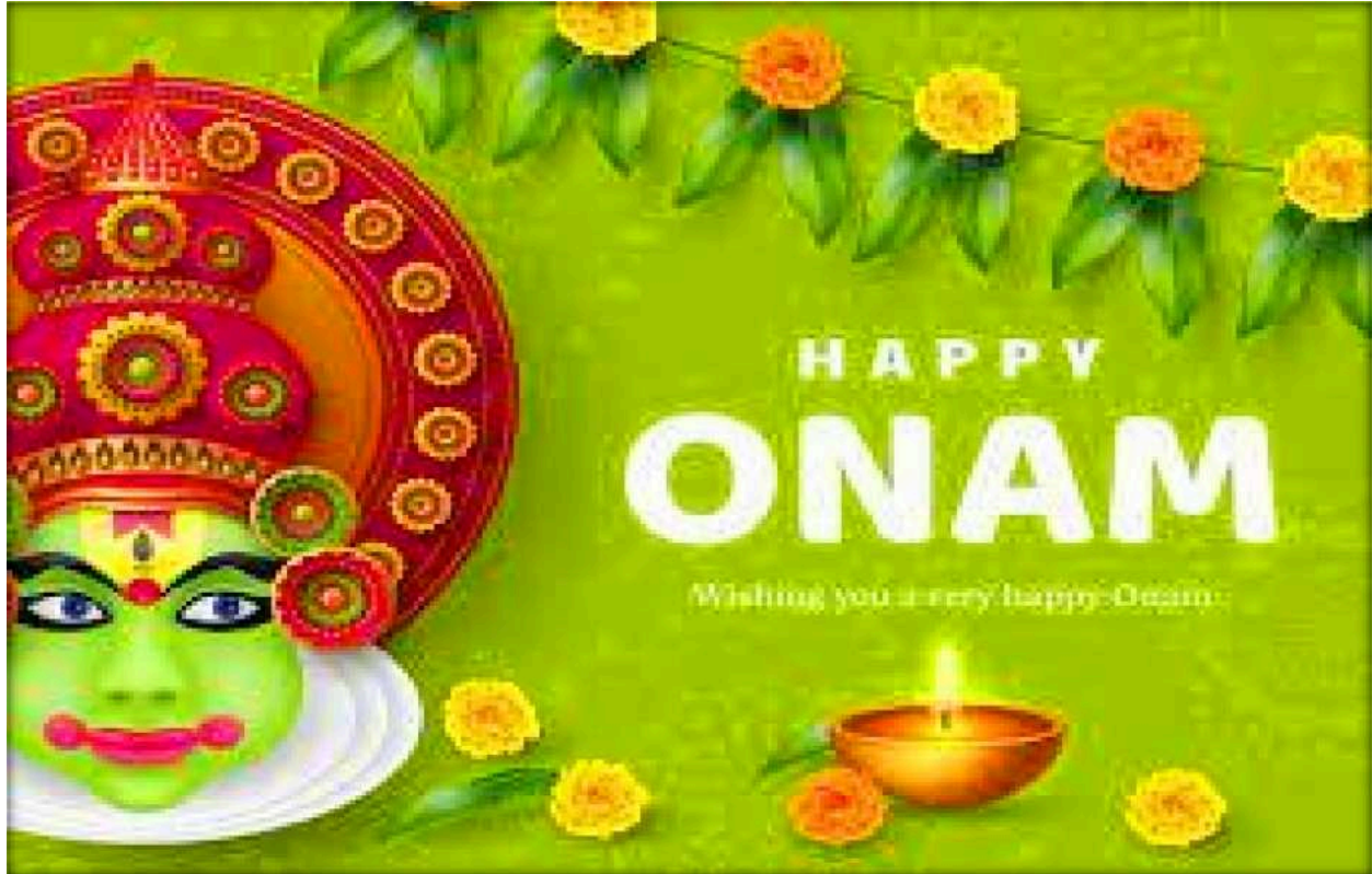
Image Onam Greetings

Through such celebrations, Quantum University continues to nurture an inclusive environment, fostering understanding, respect, and unity among its diverse student community. The Onam celebration stands as a beacon of cultural acceptance, echoing the university's dedication to creating a harmonious and inclusive learning environment for all.