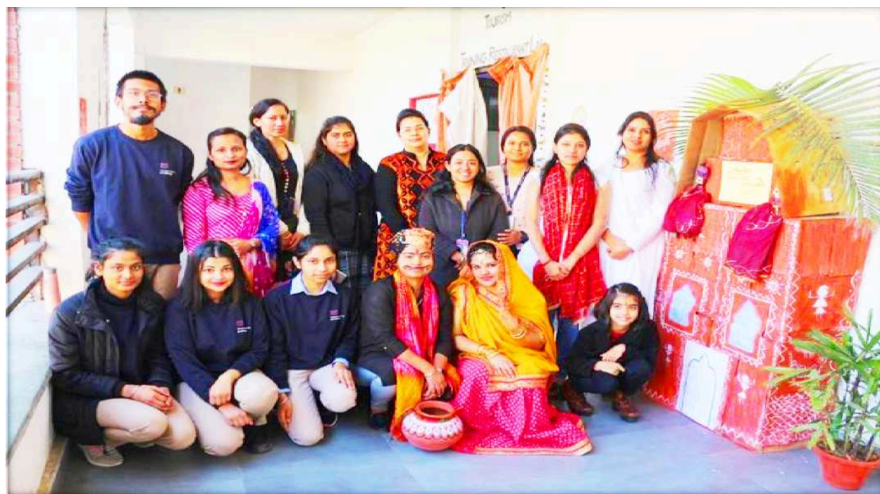
A cultural feast that tantalize taste buds and celebrated diversity at the Rajasthani Food Fes