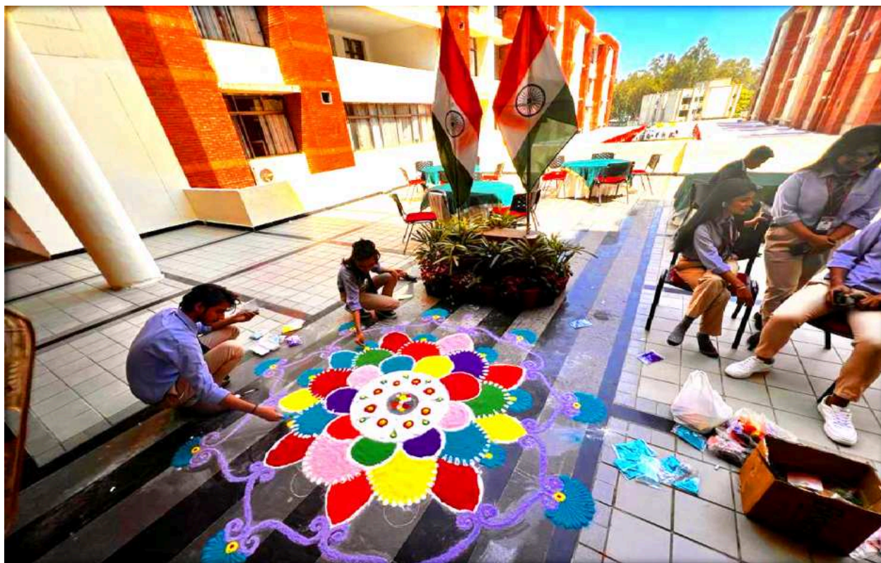
One rangoli many hands, a symbol of unity in diversity and Diwali celebration

cultural heritage, sharing the essence of Diwali and India's diverse traditions. The competition became a vibrant tapestry of colors, cultures, and creativity, leaving an indelible mark on the university's ethos of inclusivity and respect. Quantum University continues to create spaces where students can express their cultural identities, learn from one another, and celebrate the beautiful mosaic of India's cultural heritage.