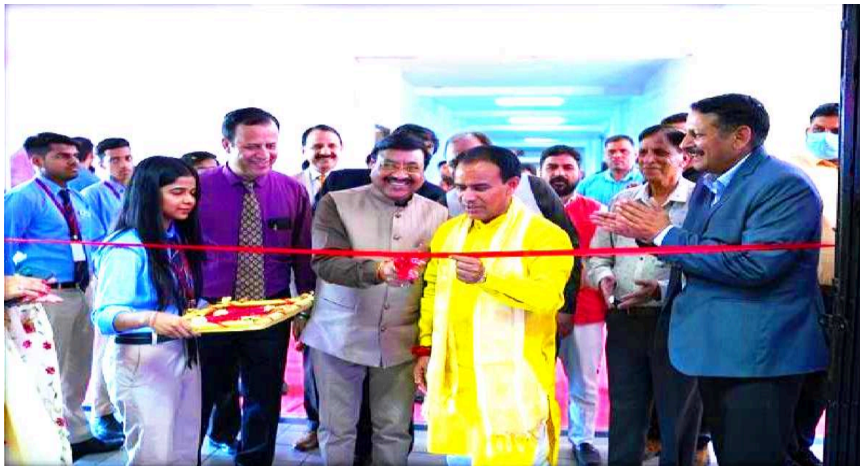
Images from Srijan a Quantum's Initiative to Provide a Platform for Everyone to Showcase Their Entrepreneurial Talent