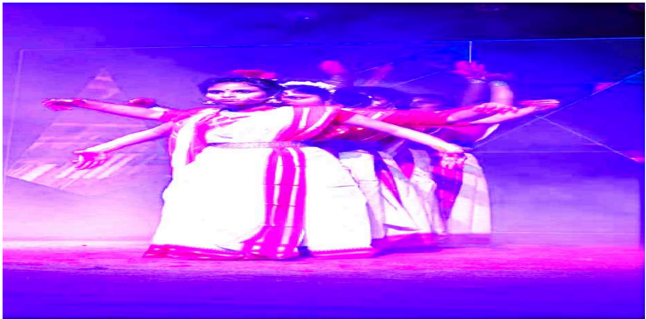
Outstanding Performance by Students during the Theme Based Dance Program