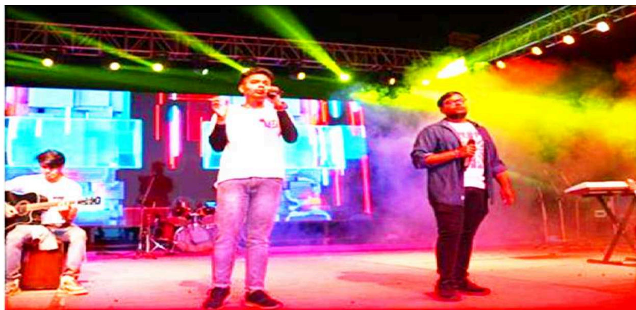
Glimpses from freestyle fusion a cultural dance and singing program