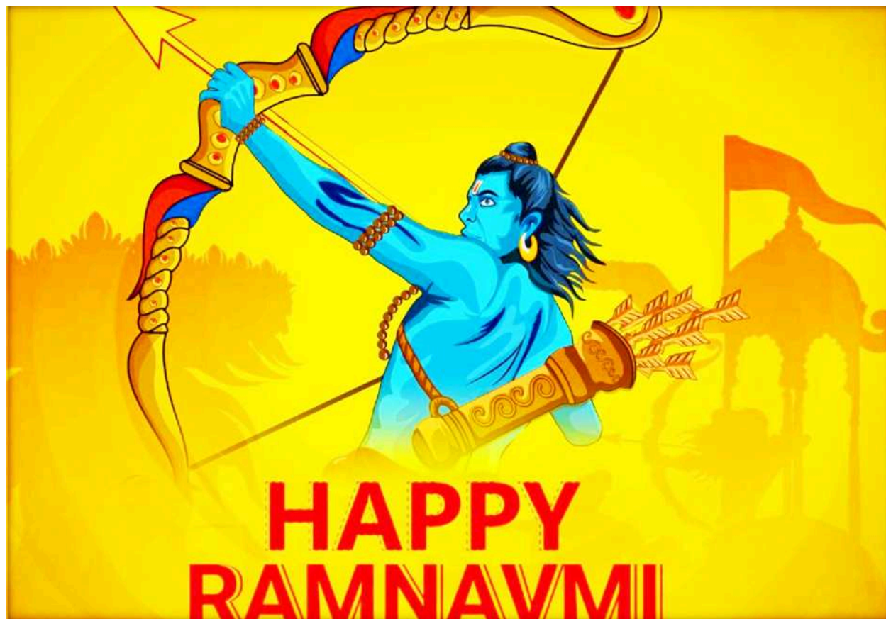
Image: Ram Navami Greetings

cultural diversity within the university community. Through the joyous festivities and shared spiritual experiences, the celebration reinforced the values of inclusivity, understanding, and acceptance, fostering a sense of belonging and togetherness among all participants.