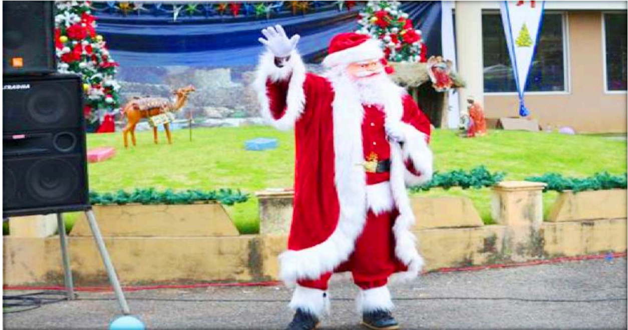
Images of celebration of Christmas program at Quantum Campus

students came together to celebrate the essence of Christmas. The event not only fostered a sense of belonging and acceptance but also reinforced the university's dedication to embracing and celebrating the rich diversity of its student body.