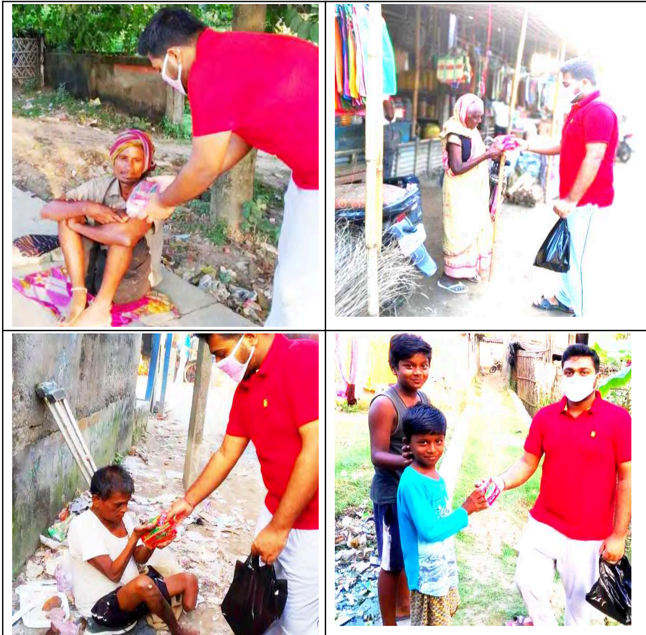
Quantum Students distributing free food kit to the poor people spreading the message of acceptance and inclusivity for all members of the society