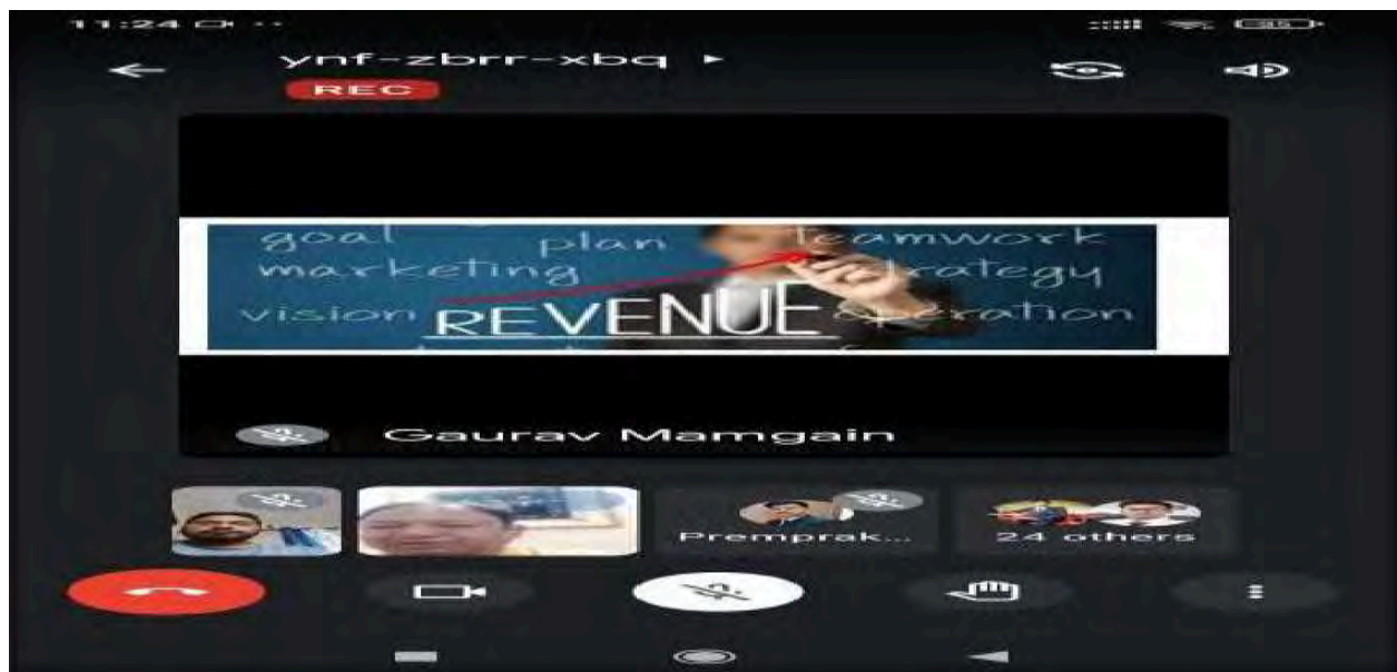
Screenshots from the online guest lecture on Revenue Management in Hospitality Industry focused on socio economic growth and diversity