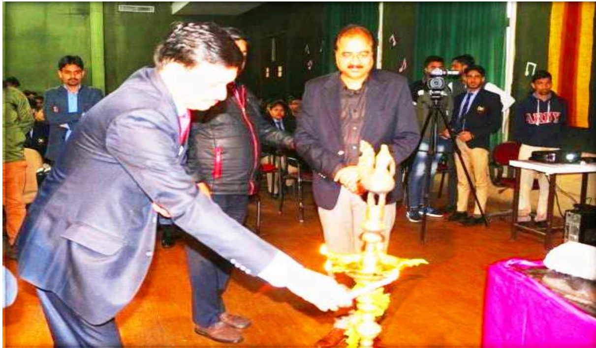
A glimpse into the Lamp lighting ceremony before the commencement of presentation on National Budget 2020

Moreover, the competition facilitated informed dialogues, nurtured critical thinking, and inspired creative problem-solving. It emphasized the imperative need for equitable growth and development, ensuring that policies and strategies address the diverse needs and aspirations of every segment of society. In essence, the event not only celebrated the intellectual acumen of the participants but also reinforced Quantum School of Business's commitment to fostering a society marked by inclusive progress and socio-economic harmony.