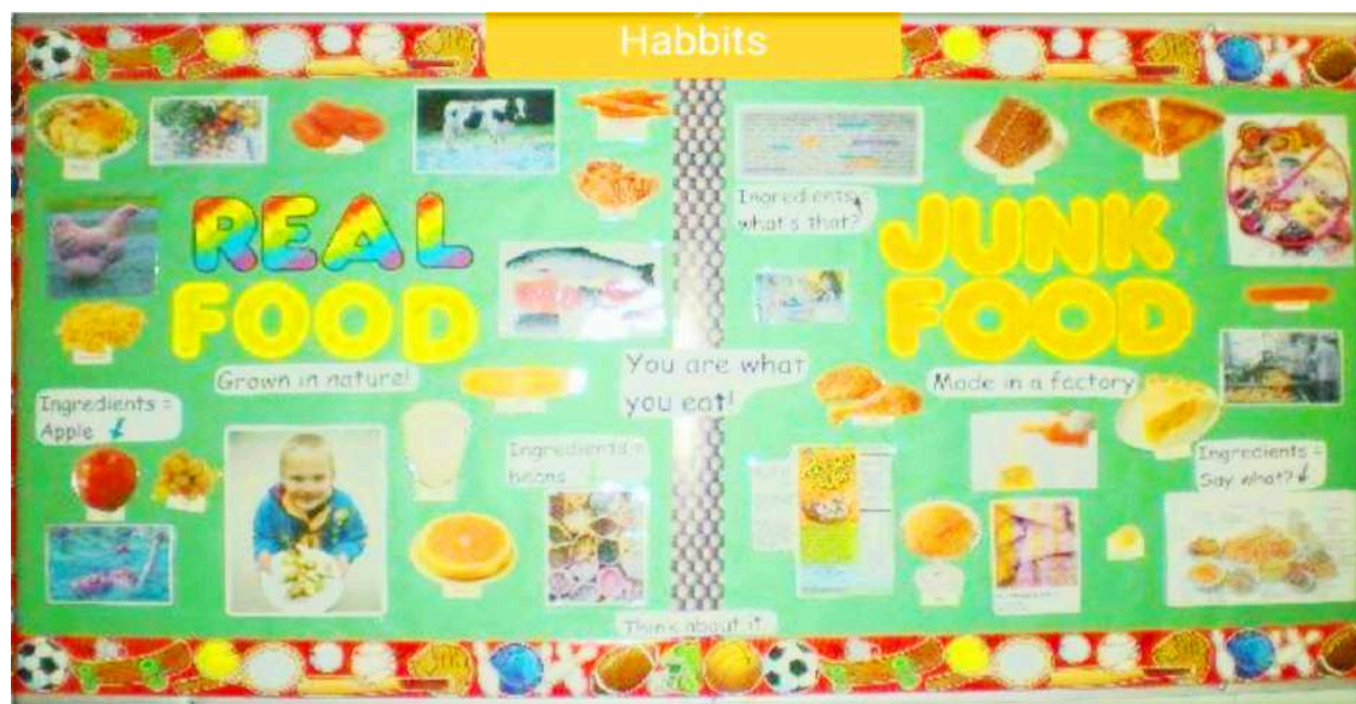
Image of Presentation used by students to teach about healthy food habits

Beyond the celebration, this initiative had a broader purpose. It sought to address pressing issues related to food inequality. The program championed the cause of ensuring access to nutritious and affordable food for everyone, regardless of their cultural, regional, or communal backgrounds. It stood as a poignant reminder of the pivotal role food plays in our lives and the collective responsibility we share in creating a sustainable, inclusive food system. Through this event, Quantum School of Agriculture Studies reinforced the notion that working together, hand in hand, is essential to build a future where everyone is nourished and included.