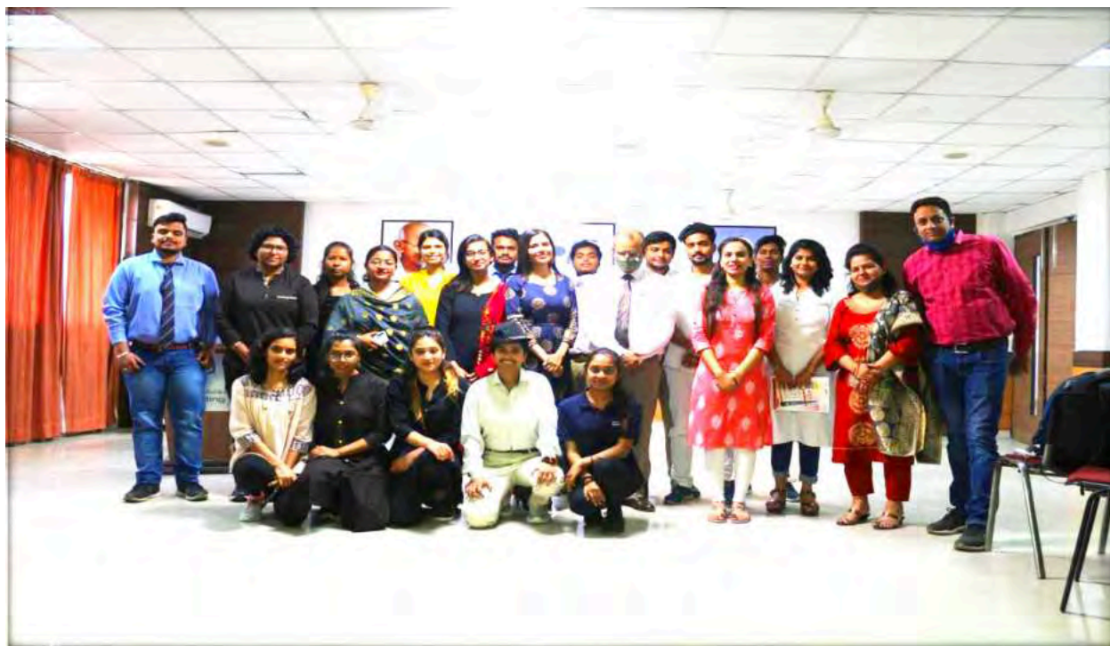
A glimpse from the stage play of Martyrdom of Bhagat Singh