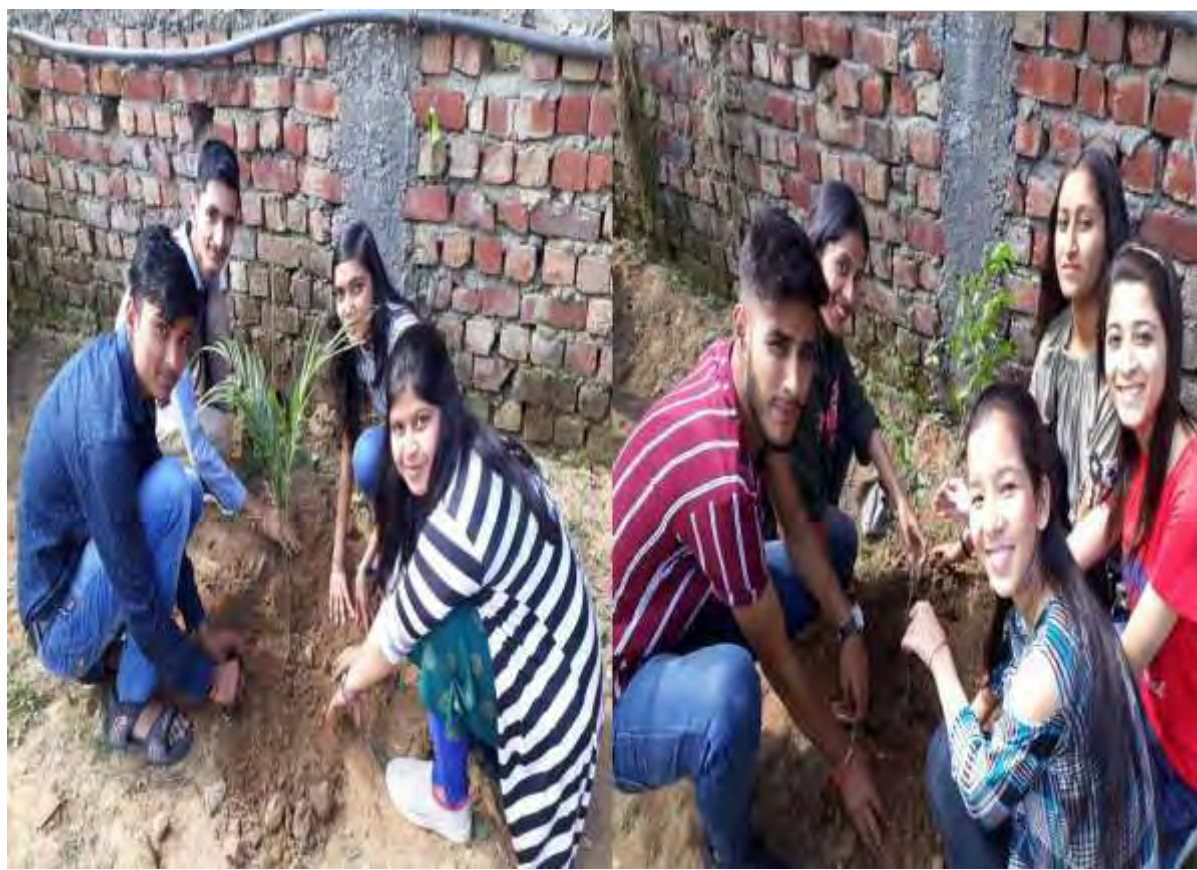
Tree Plantation drive at Quantum University Campus

Tree plantation drives are important initiatives for environmental conservation and sustainability. During the drive, participants typically come together to plant trees in designated areas of the villages. This activity helps to increase green cover, combat climate change and promote biodiversity.