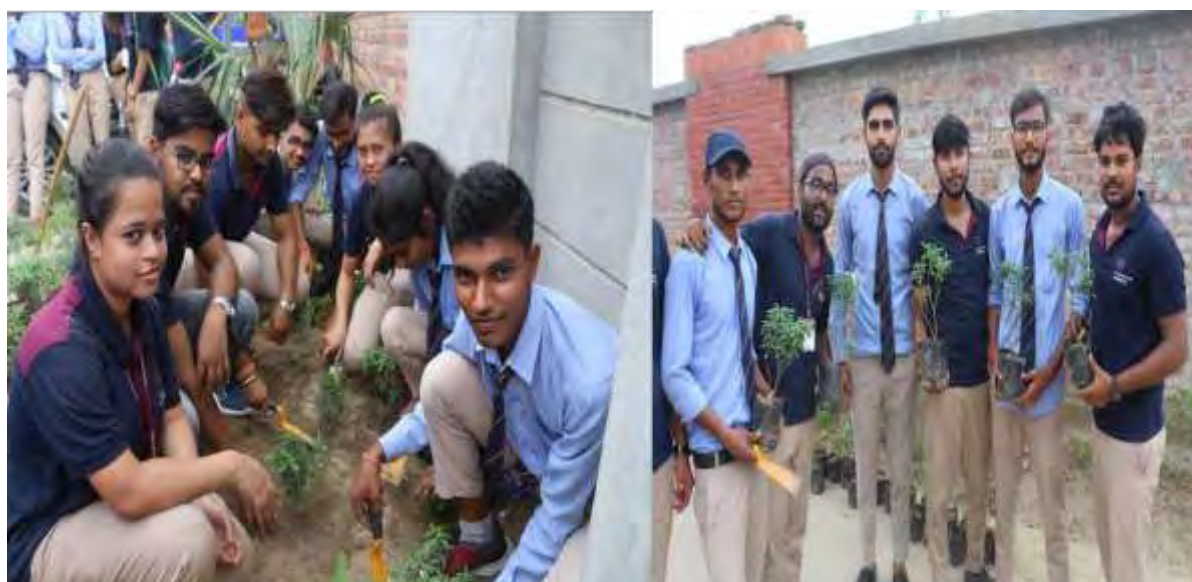
Tree plantation on the occasion of World Environment Day Celebration

The event culminated with a "Green Campus Pledge," where all participants vowed to adopt eco-friendly practices and contribute towards making Quantum University a sustainable and environmentally responsible institution. Around 23 students participated in the event.