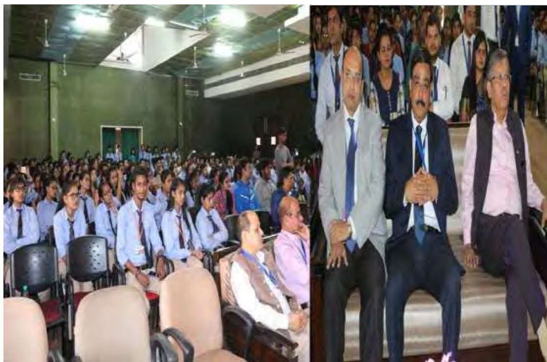
A view of National Conference on Advances in Agriculture and Natural Sciences in sustainable development