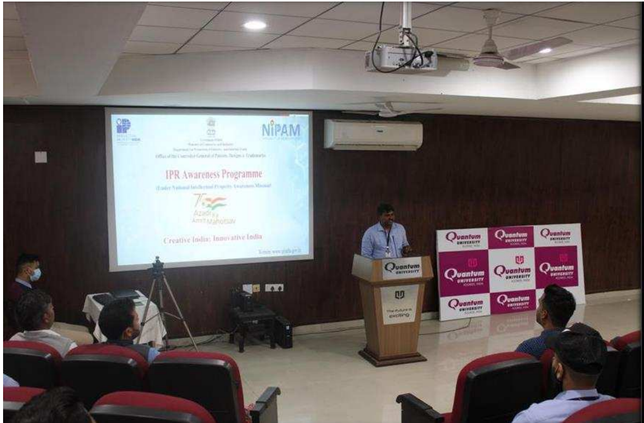
Image from workshop on intellectual property rights conducted under sensitization on professional ethics

stakeholders. This holistic approach not only safe guards the organization's intellectual assets but also contributes to the overall ethical framework, ensuring a sustainable and responsible business environment.