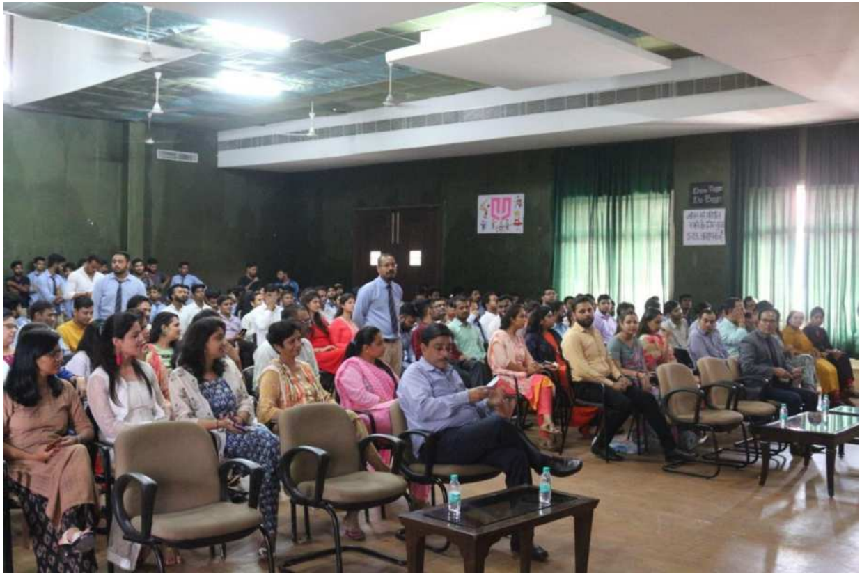
Picture from Annual Awareness Programme on Professional Ethics for Faculty and Staff

upholding the highest standards of conduct.