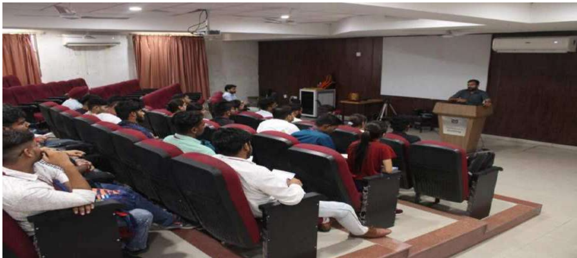
Image from Annual Awareness Programme on Professional Ethics for Students

The Annual Awareness Programme on Professional Ethics for Students successfully educated students about the importance of adhering to the established guidelines. It provided them with a deeper understanding of ethical behavior, accountability, and respect for others. The interactive nature of the program fostered engagement and allowed students to connect with the principles of the Professional Ethics on a personal level. It is anticipated that this program will contribute to a more respectful and inclusive environment within Quantum University. By promoting and reinforcing the Professional Ethics, Quantum University continues to prioritize the holistic development of its students and strives to create a positive and nurturing atmosphere for all.