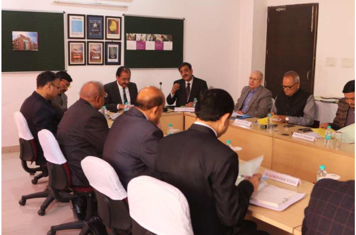
Picture from Panel Discussion on the Role of Senior Officers in the Effective Implementation of Code of Conduct