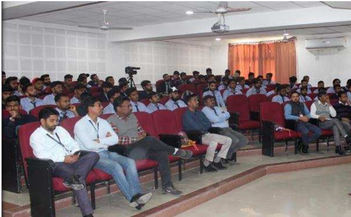
Picture from a Workshop on Professional Ethics for Students and faculty members