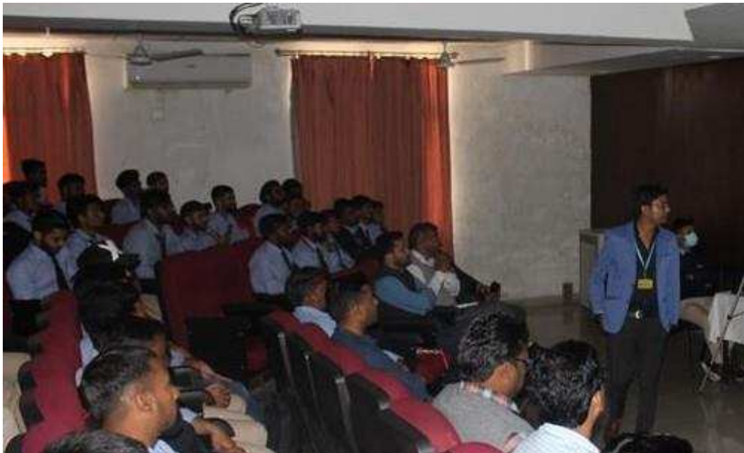
Glimpse from Workshop on Navigating Ethical Challenges in Education