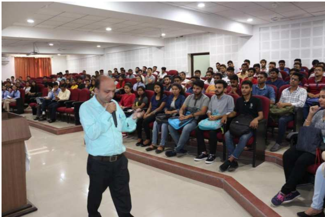
Glimpse from Training on Professional Ethics and Living with Integrity for students

Recommendations: The report concludes with a set of recommendations for organizations to embrace integrity as a way of life and implement a Professional Ethics. These recommendations emphasize the need for continuous education, training, and reinforcement of ethical values. They also highlight the importance of integrating integrity into recruitment, performance evaluation, and organizational policies and procedures.