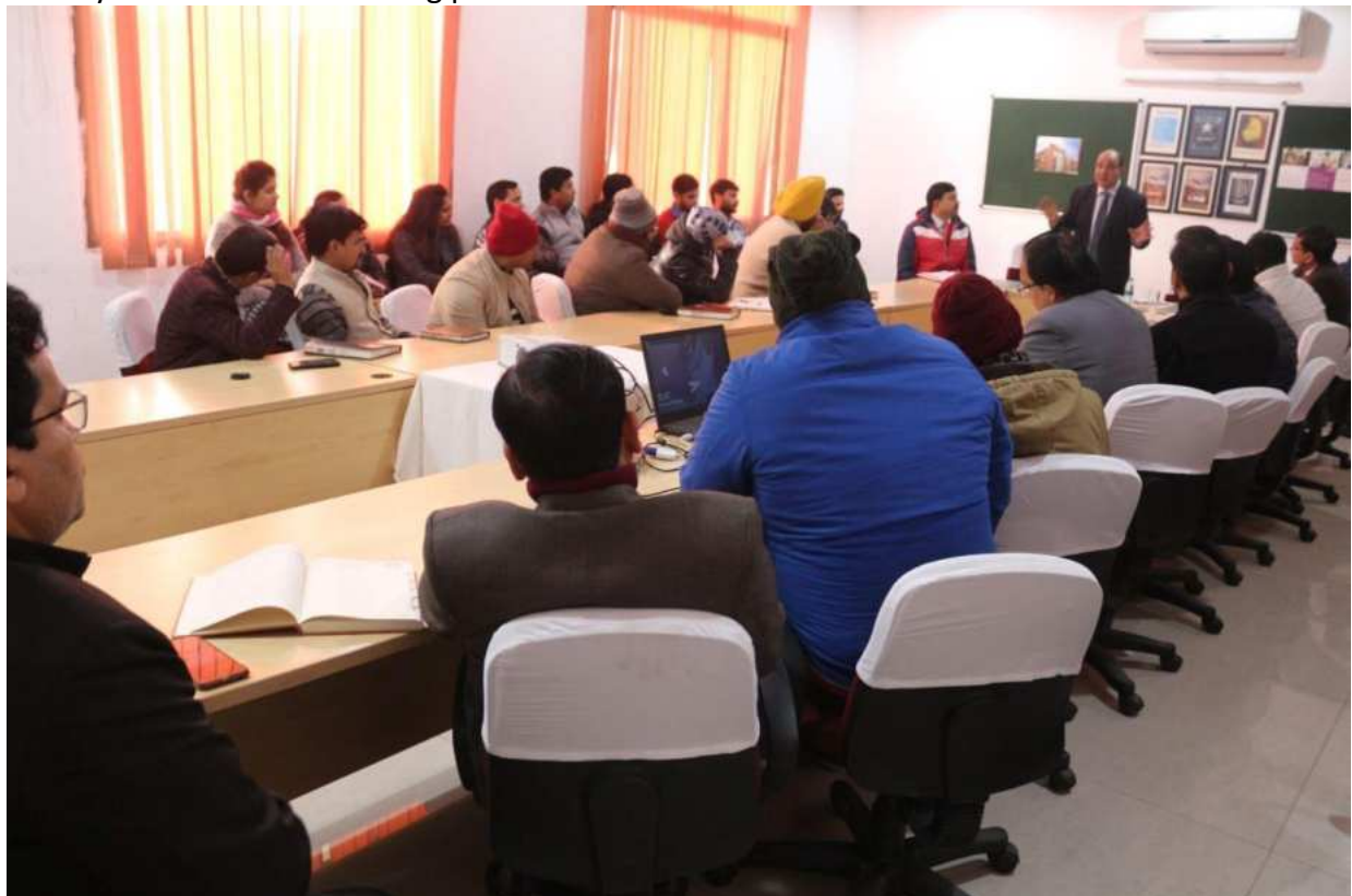
Glimpse of Session on Topic “Ethics versus Morality” under Faculty Development Program

The article "Ethics versus Morality: A Problematic Divide" emphasizes the complexities arising from distinguishing between ethics and morality. The distinct definitions and theoretical boundaries are not easily separable in practice, leading to challenges in making ethical decisions, particularly when faced with varying cultural contexts and conflicting moral norms. A comprehensive approach that recognizes the interplay between ethics and morality is essential for addressing complex ethical issues in both theoretical and applied contexts. Professionals and decision-makers should be aware of this problematic divide to foster more thoughtful and morally sound decision-making processes.