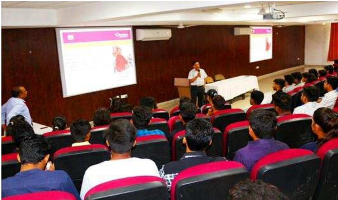
Workshop on Professional Ethics for Quantum University Teachers

to all participants and encouraged them to actively apply the principles they had learned, thereby contributing to the enhancement of the education sector. Participants were encouraged to continue their reflection and share their experiences and insights in a follow-up discussion group. This ongoing dialogue aimed to support educators in their journey toward ethical and professional teaching practices. The "Guiding Principles: A Workshop on the Professional Ethics for Teachers" served as a significant step in promoting ethics and professionalism among educators, ultimately benefiting both teachers and students in the educational ecosystem.