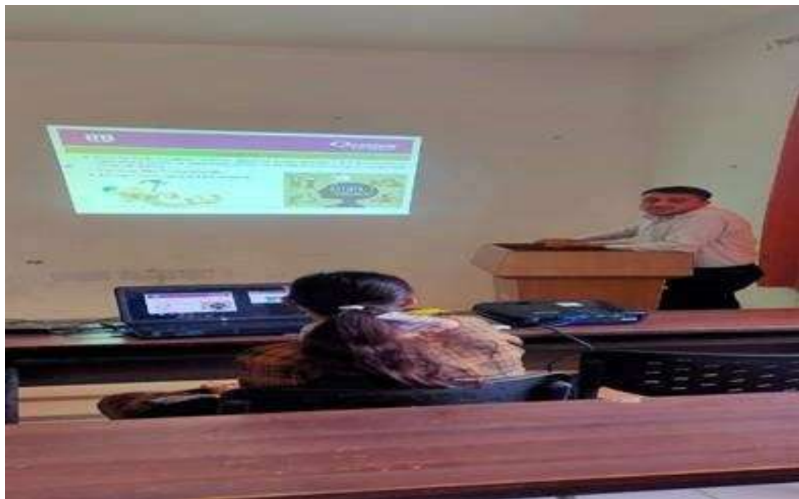
Image from workshop on Professional Ethics on the topic “Ethics versus morality: A problematic divide”