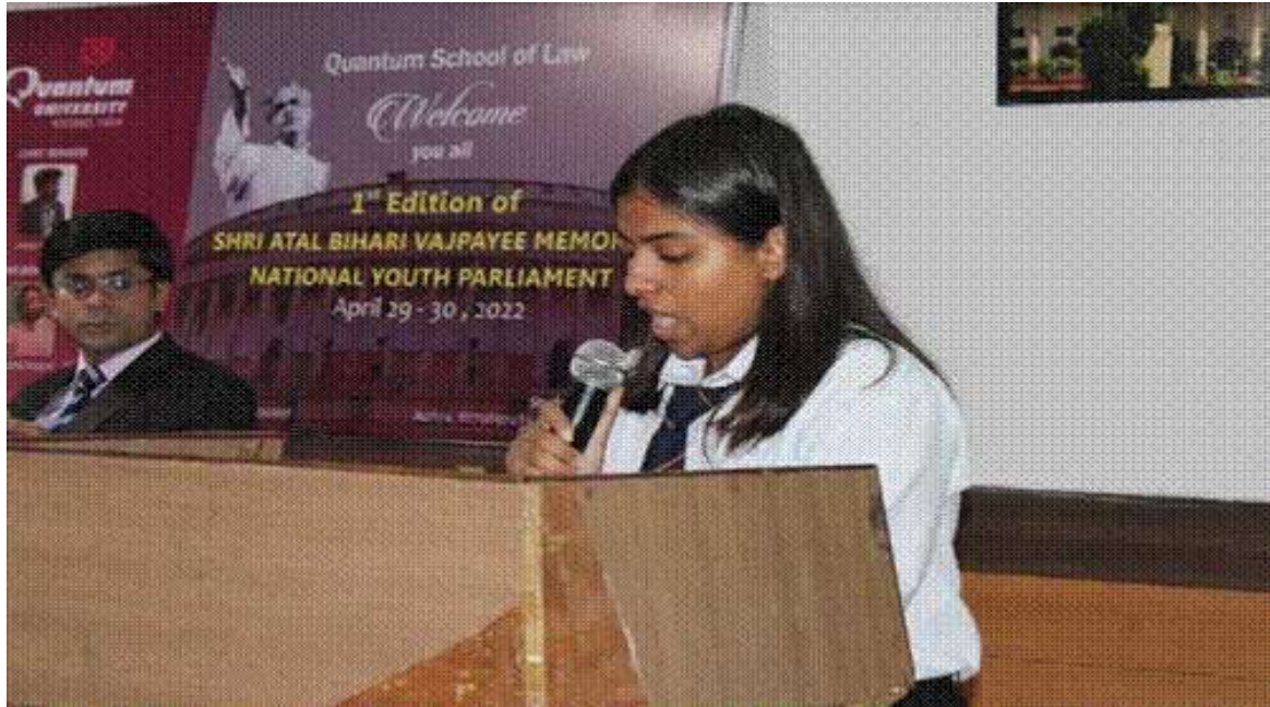
Image from Youth Parliament Debate Session conducted under Sensitization on Professional Ethics