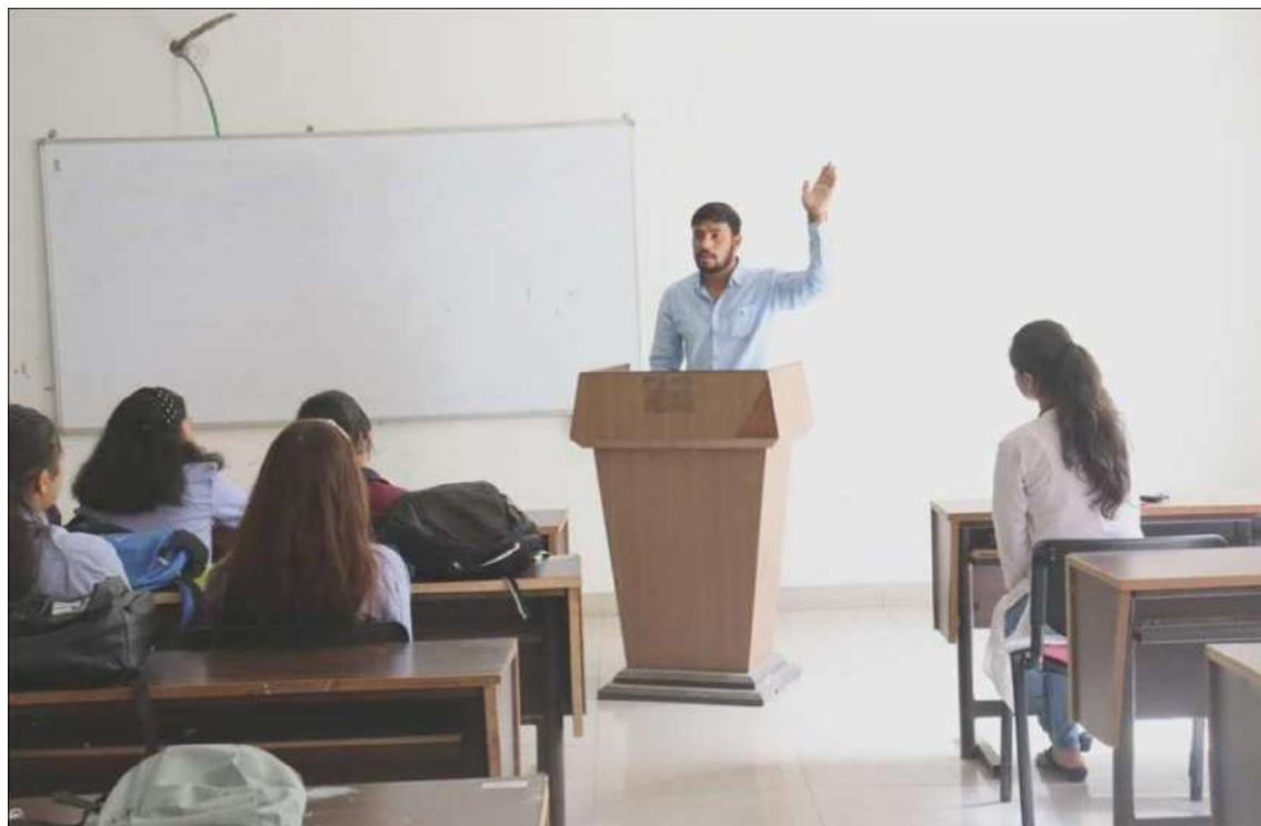
Image from workshop on Professional Ethics on the topic "Professional Ethics and Holistic Well-being"