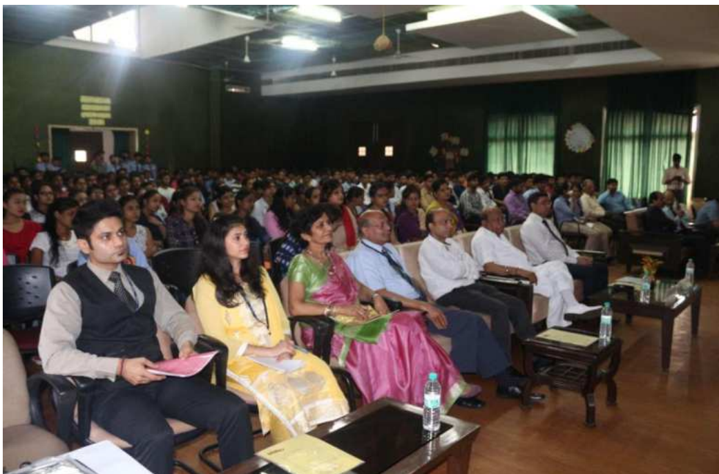
Glimpse from Awareness Programme on Professional Ethics held at Shyam Ji Auditorium

The Annual Awareness Programme on Professional Ethics for Students successfully educated students about the importance of adhering to the established guidelines. It provided them with a deeper understanding of ethical behavior, accountability, and respect for others. The interactive nature of the program fostered engagement and allowed students to connect with the principles of the Professional Ethics on a personal level. It is anticipated that this program will contribute to a more respectful and inclusive environment within Quantum University. By promoting and reinforcing the Professional Ethics, Quantum University continues to prioritize the holistic development of its students and strives to create a positive and nurturing atmosphere for all.