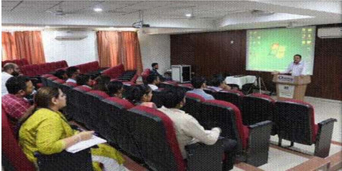
Image from Annual Awareness Programme on Professional Ethics for Faculty and Staff

upholding the highest standards of conduct.