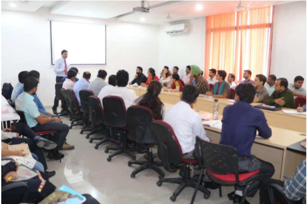
Image from Sensitization Workshop on Professional Ethics to form sound foundation