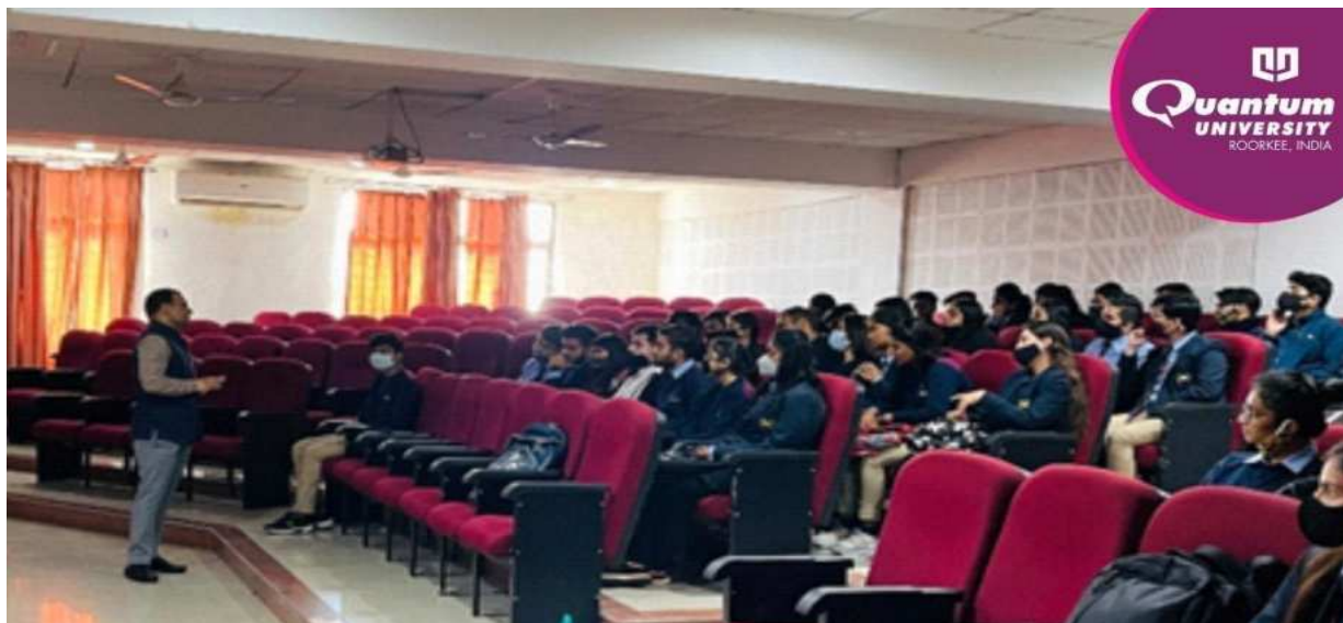
Glimpse of Session while Observing Human Rights Day by Sensitizing on Professional Ethics

This report concludes that by integrating human rights principles into the Professional Ethics, organizations can foster a culture of respect, integrity, and social responsibility. Harmonizing Human Rights Day and the Professional Ethics not only strengthens the ethical fabric of organizations but also contributes to the promotion and protection of human rights within broader society. By embracing this harmonious approach, organizations can demonstrate their commitment to upholding human dignity and creating a more just and equitable world.