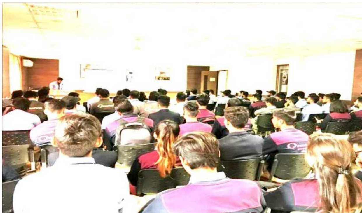
Moments Captured From the Workshop on Future of Quantity Surveyor