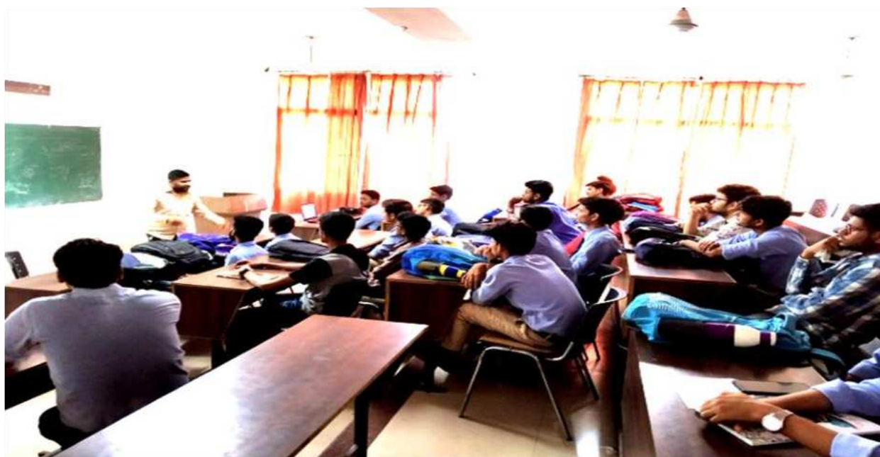
Snapshot from the Workshop on Vehicle Dynamics