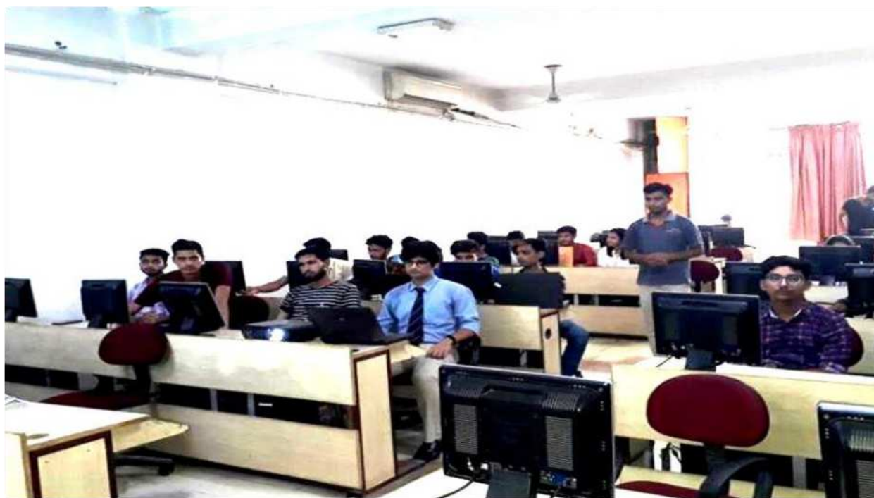
Pictures from Codex Club Organizing a Live Workshop on Introduction of Computers and C Programming Language