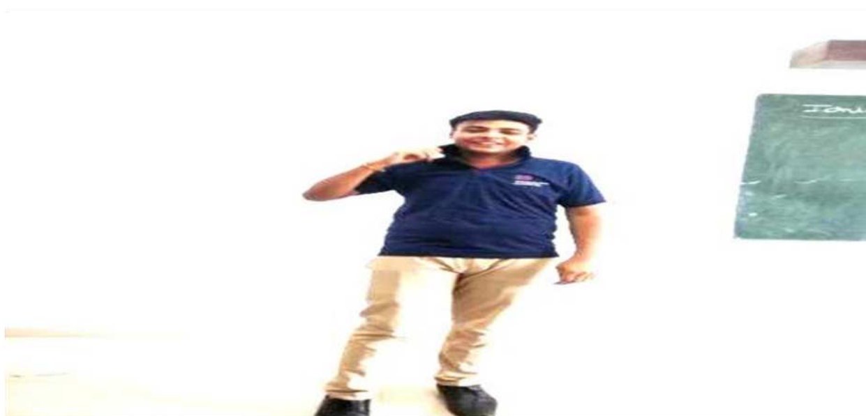
Glance at the Solo and Dual Acting Show Organized by the Theater Club Members