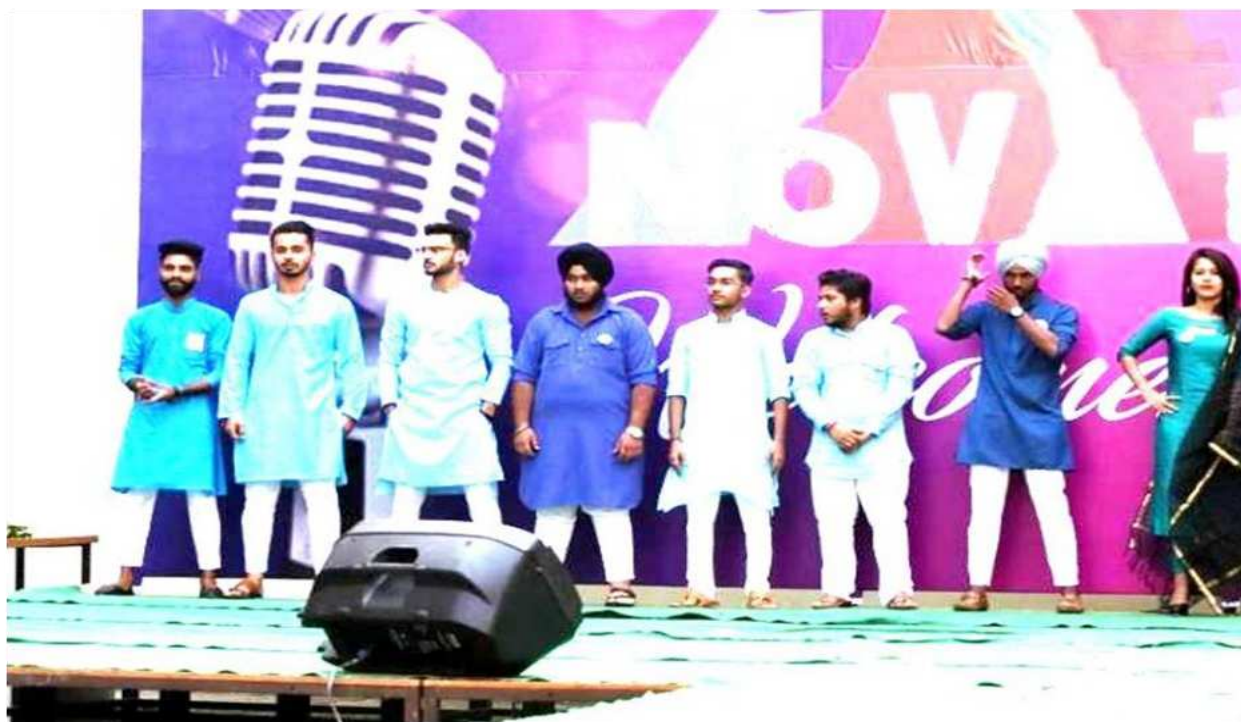
Few Closeups and Snapshots from the A Fiery Fashion Show TO Close the Day Dominated by Damsels and Handsome Dudes