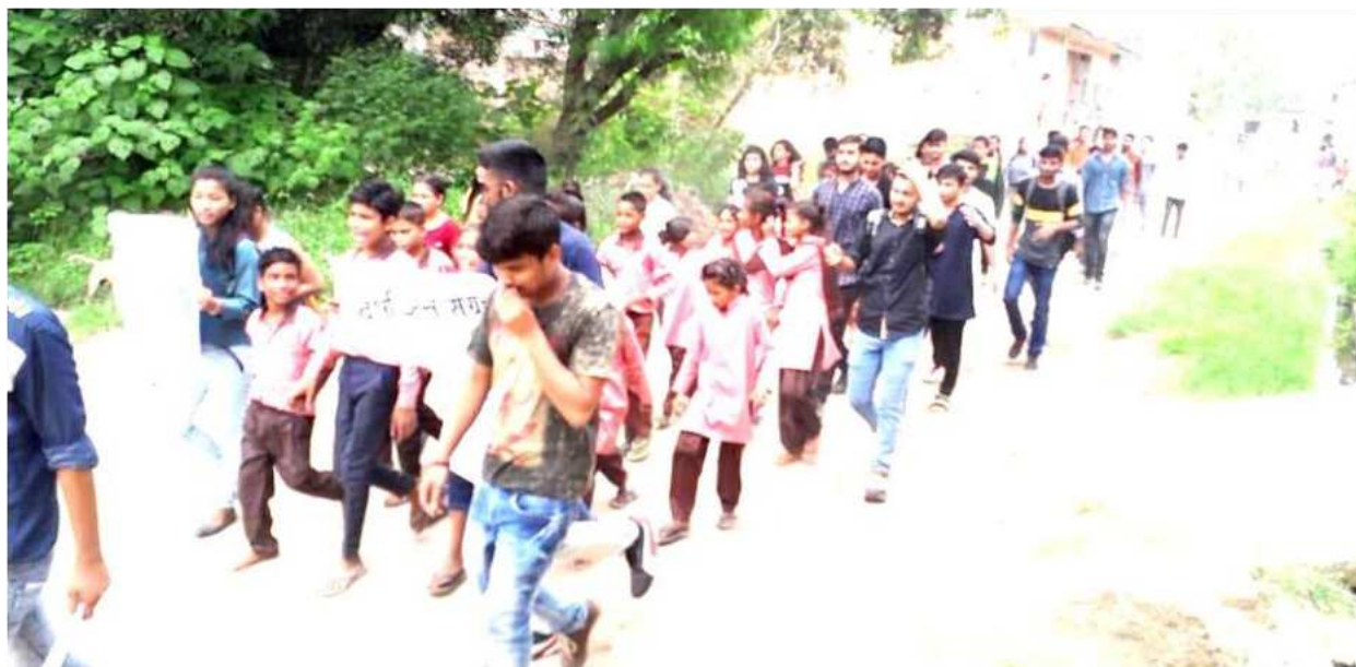
Memories Frozen in Pictures from an Event Rain Water Harvesting Organized and Executed by PAHAL Club