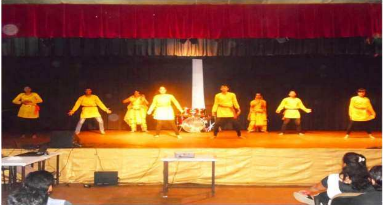
Bollywood Style Performance by Quantum Students