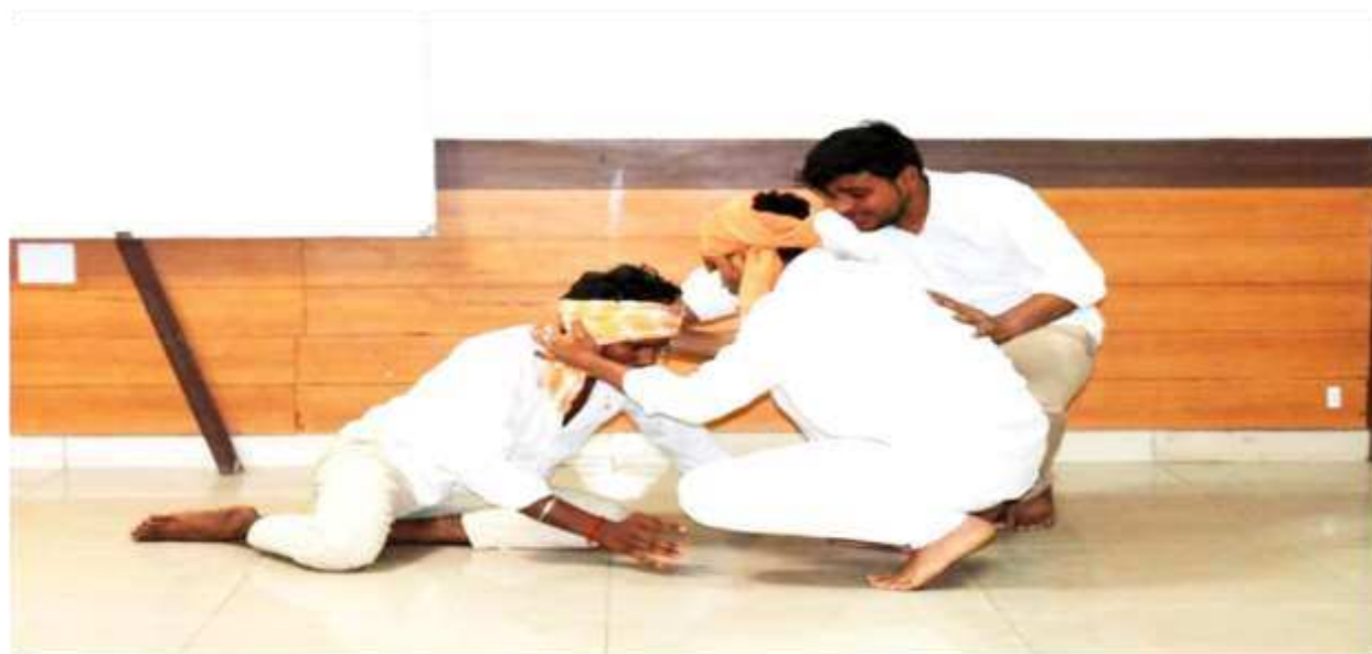
Moments from the Act of Hunger Strike of Shahid Bhagat Singh Play