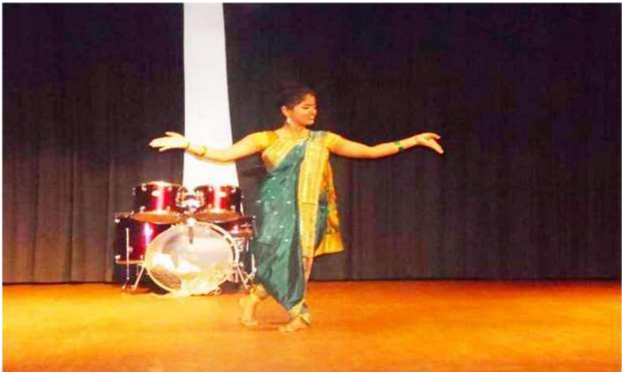
Eloquent Dancers Gracing the Stage with Nepali Dance and Famous Maharashtrian Lavni Dance