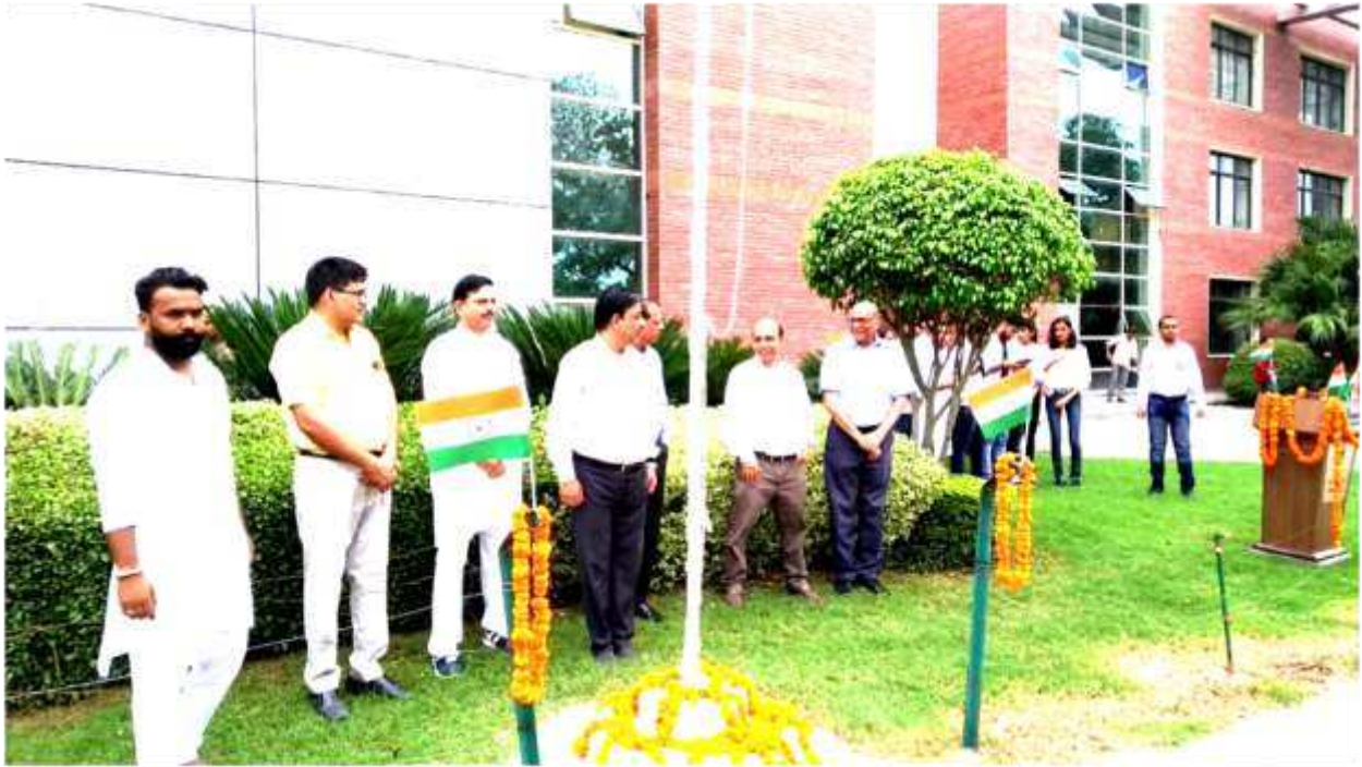
Picture from Independence Day Celebration from Quantum University Dignitaries