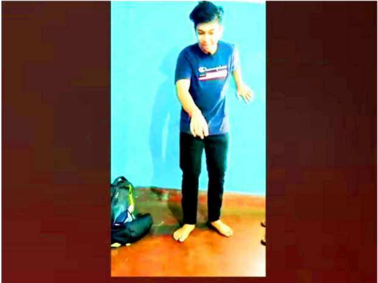
Snap Shot From Student Performing During the Mono Act Competition