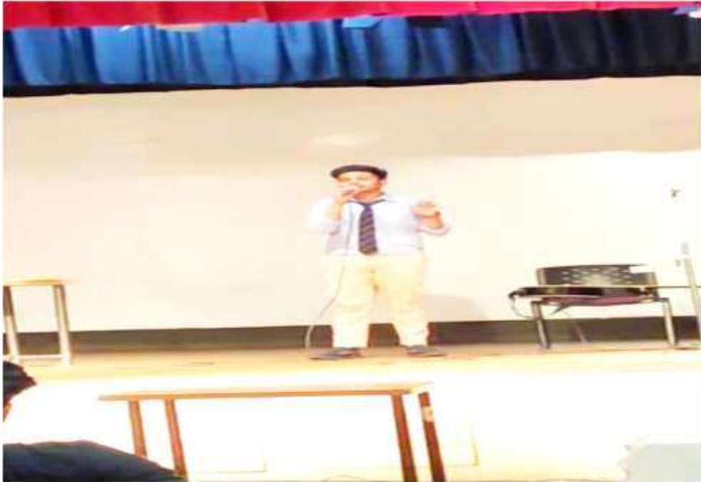
Rahul Showcasing the Immense Talent within its Student Community