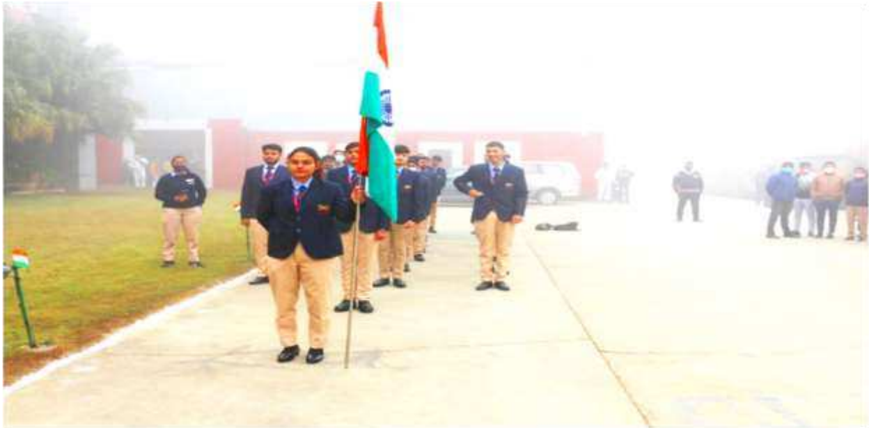
NCC Parade on a Cold Winter Morning of 26 th January (Republic Day of India)