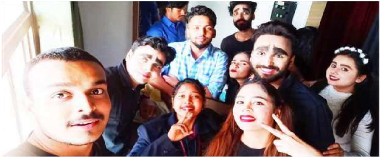
Posing to Create Memories, Meme Actors BackStage