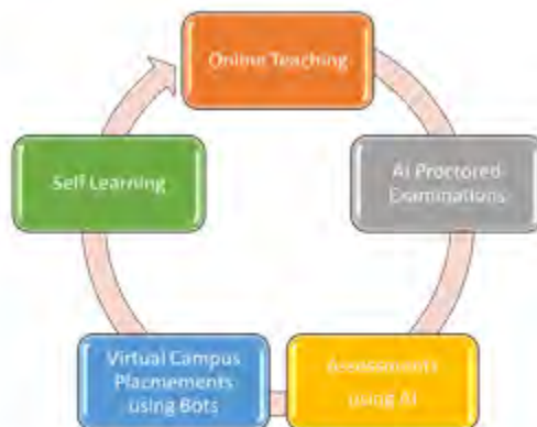
Fig. 4. Areas of Integration of AI at Educational Institutions [akbhatnagar, et al]

This has turned out to be an ultimate tool to interact, learn and exchange knowledge (Poola, 2017). With the exhaustive integration and use of AI through NEP in India's education system, all the processes at educational institutions will be more effective, Fig. 4.