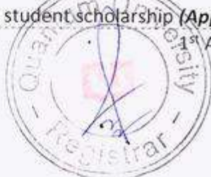
Registrar Quantum University